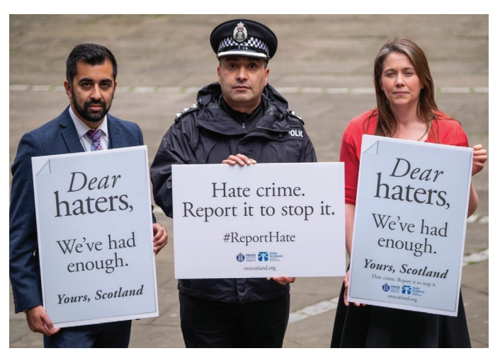
In early 2021 the Scottish Parliament passed controversial laws which criminalise offensive speech, even if spoken in private around the family dinner table.

The hidden agenda behind such laws is the development of a culture of fear and self-censorship for the purpose of political intimidation and control. Thoughts and ideas which are undesirable to special-interest groups will be able to be silenced simply by framing them as "hateful". Such groups will claim to believe in free speech, just as long as it's speech THEY approve of.